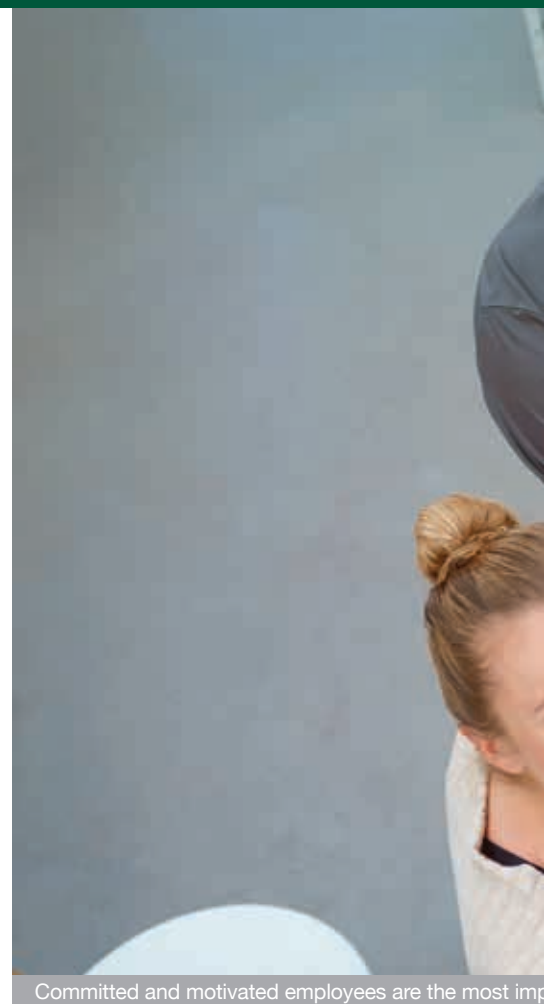
Committed and motivated employees are the most important

We have, for instance, produced a manual for the trainers to help