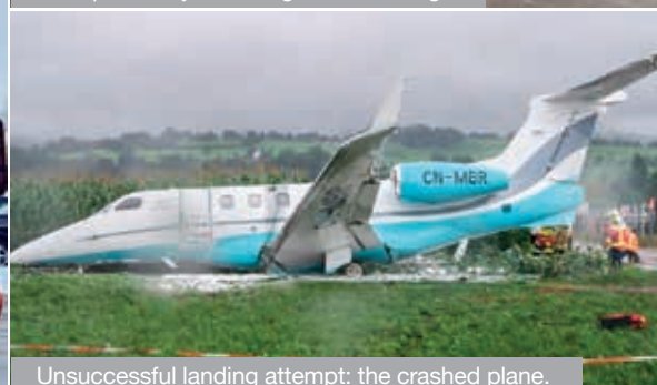
Unsuccessful landing attempt: the crashed plane.