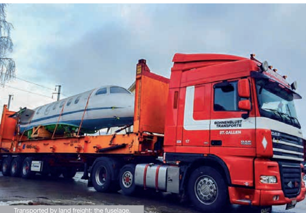
Transported by land freight: the fuselage.

Contact ZIEGLER (Schweiz) AG Angelo Melillo Bionstrasse 5 CH-9015 St. Gallen Tel. +41 71 311 13 63 sg@ziegler.ch