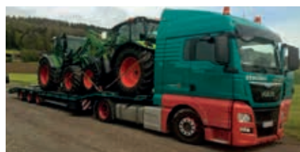
crew4you imports tractor Page 9