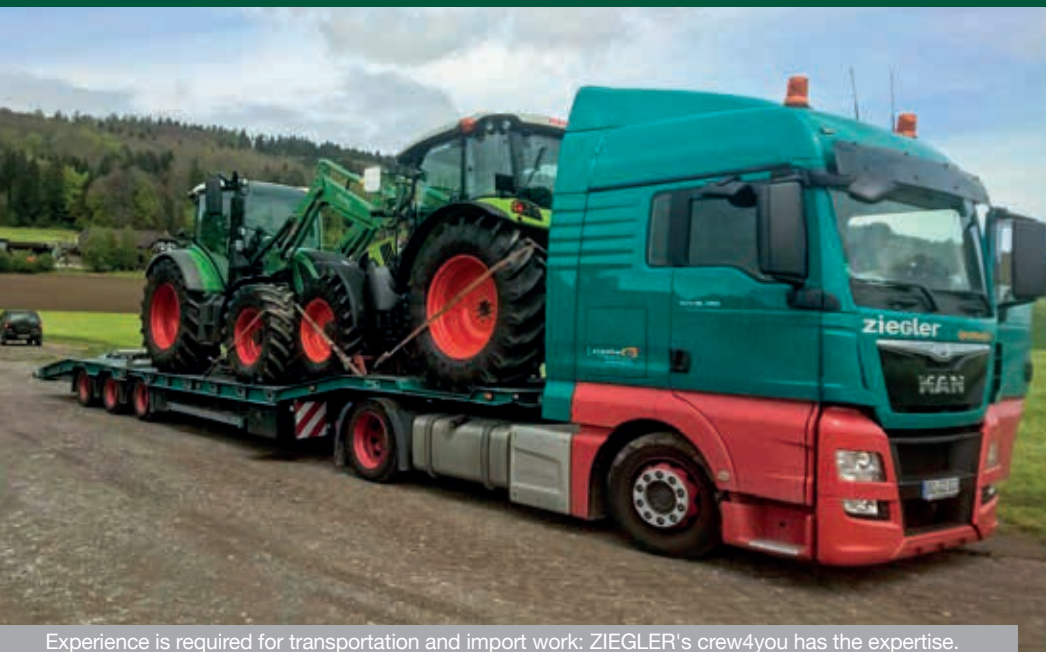
Experience is required for transportation and import work: ZIEGLER's crew4you has the expertise.