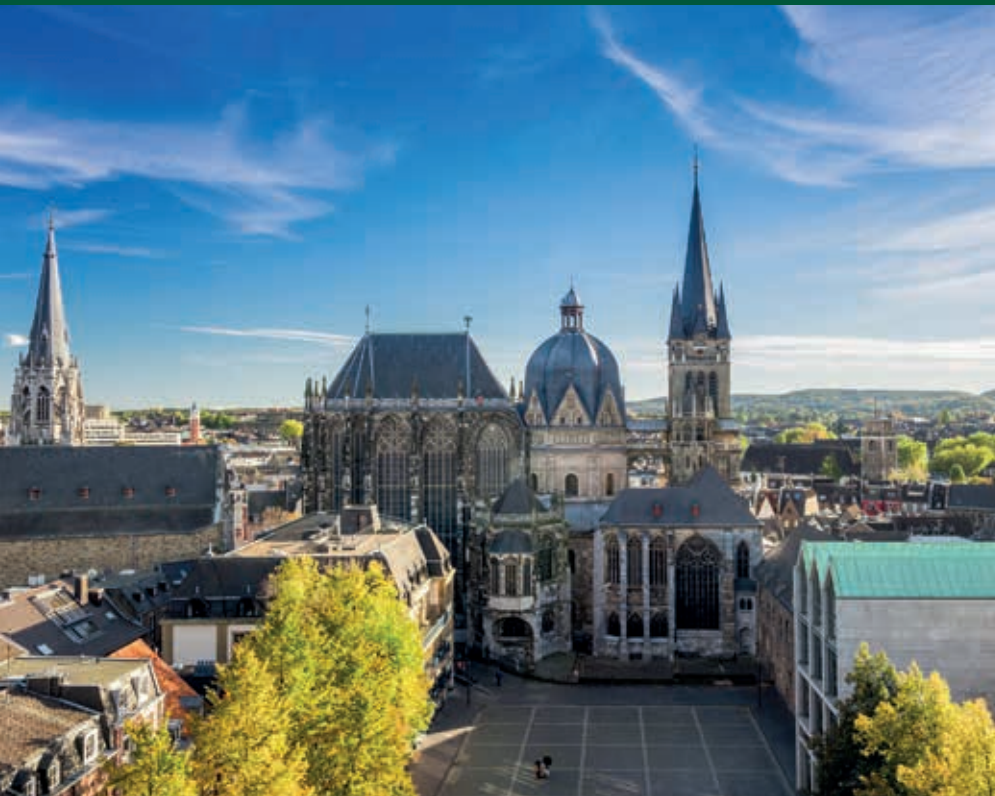
Aachen: the city with the famous cathedral was the location of ZIEGLER Germany's foundation in 1967.