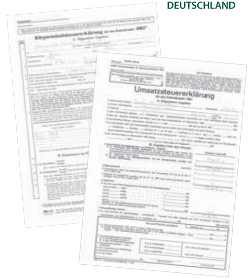
From the ZIEGLER archive: corporation tax from the founding year of 1967 and the first sales tax declaration.

Anniversary: 50 years of ZIEGLER Germany