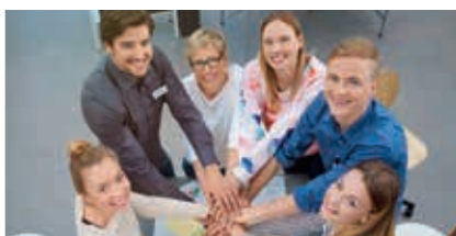
Employee development at ZIEGLER Page 10