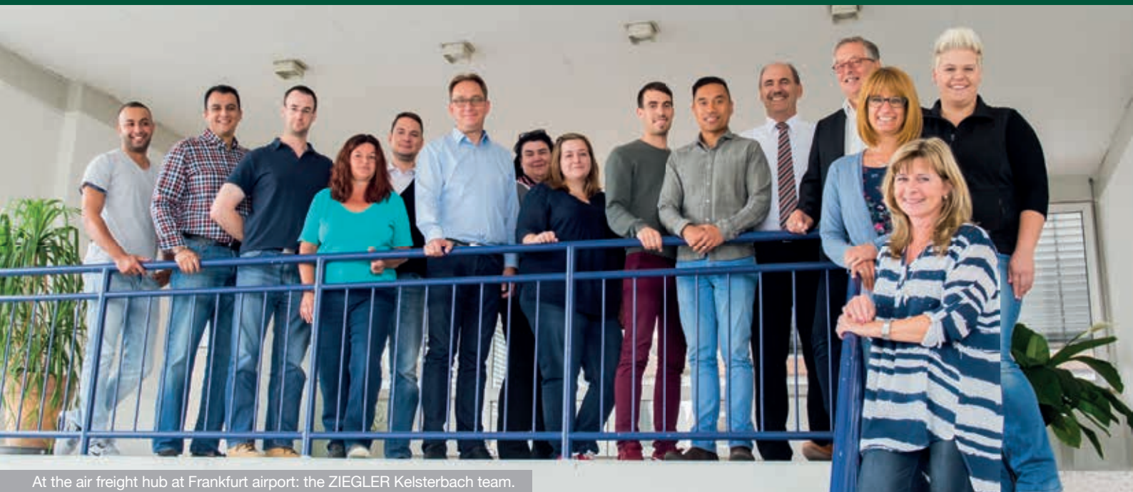
At the air freight hub at Frankfurt airport: the ZIEGLER Kelsterbach team.

employees moved in in January 2002. Now ZIEGLER was also able to offer extensive services such as picking and packaging. This represented a massive step forward.