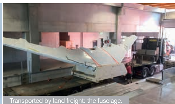
Transported by land freight: the fuselage.