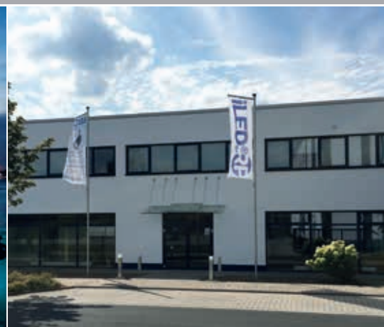
ROPAG company building in Rodgau, Hesse.

fluorescent tube with a 22W LED fluorescent tube, you can make a saving of more than € 300 in 4 years (24 hour operation and 7 days a week with electricity costs of € 0.25 / kWh).