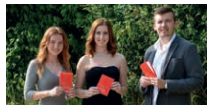
Successful training at ZIEGLER Page 17