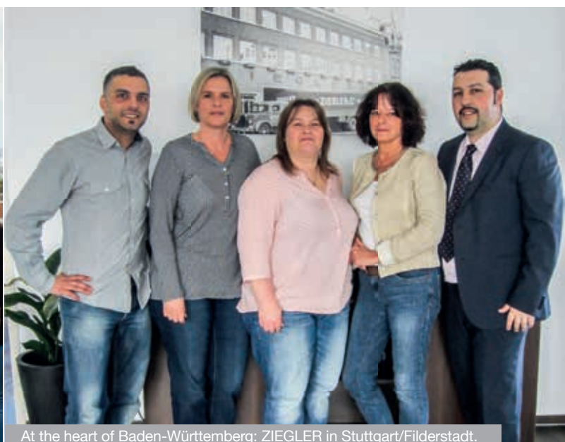
At the heart of Baden-Württemberg: ZIEGLER in Stuttgart/Filderstadt.