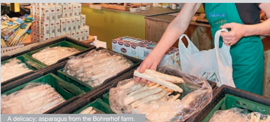
A delicacy: asparagus from the Bohrerhof farm.

On 11 May the retirees went on an outing to the Bohrerhof farm near Hartheim-Feldkirch (Germany). 30 sprightly pensioners spent a nice and enjoyable afternoon at the Bohrerhof farm in bright sunshine, accompanied by the foundation board members of ZIEGLER