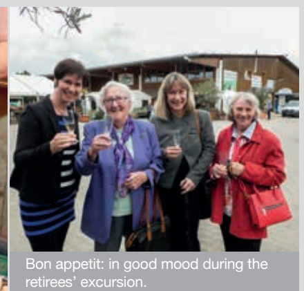
Bon appetit: in good mood during the retirees' excursion.