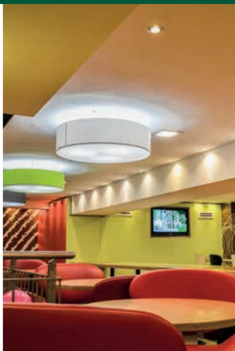
LED lighting provides pleasant, efficient and cost-effective lighting for rooms and halls.

That depends on the size of the installation. However, the following example illustrates the energy saving: by replacing a classic 58W