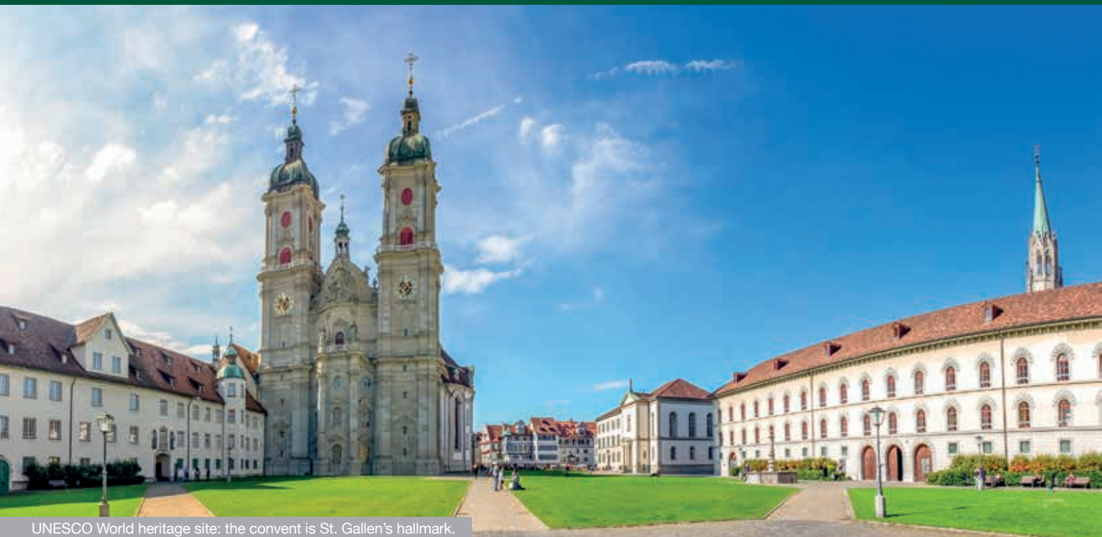
UNESCO World heritage site: the convent is St. Gallen's hallmark.