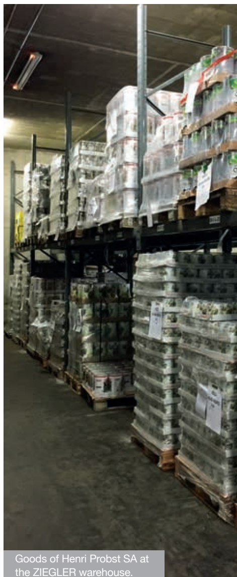
Goods of Henri Probst SA at the ZIEGLER warehouse.

ZIEGLER is a dynamic company with an extensive transport system in the European area and a good network in the warehousing and customs clearance sector. In order to be able to offer a good service with attractive prices, we must have a trustworthy and dependable partner at our side who will meet our requirements and those of our customers.