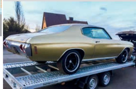
A cult car and an eye-catcher: the Chevrolet imported by ZIEGLER.

The United States has produced some wonderful cars. A lot of these cars enjoy cult status – worldwide! Now, ZIEGLER in Hamburg has imported a stylish Chevrolet vintage car for a customer and performed the shipment.