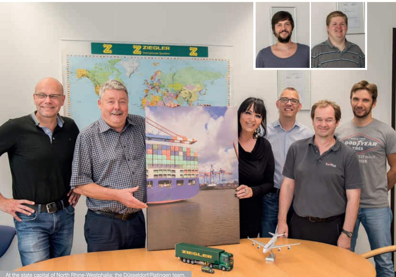
At the state capital of North Rhine-Westphalia: the Düsseldorf/Ratingen team.

In December 2000, ZIEGLER acquired a site in the industrial and commercial estate in Eschweiler, near Aachen. The planning involved a warehouse that was 3112 m 2 in size, a logistics building of 5811 m 2 in size and an office building with 709 m 2 of floor space. The property was completed in the autumn of 2001. The