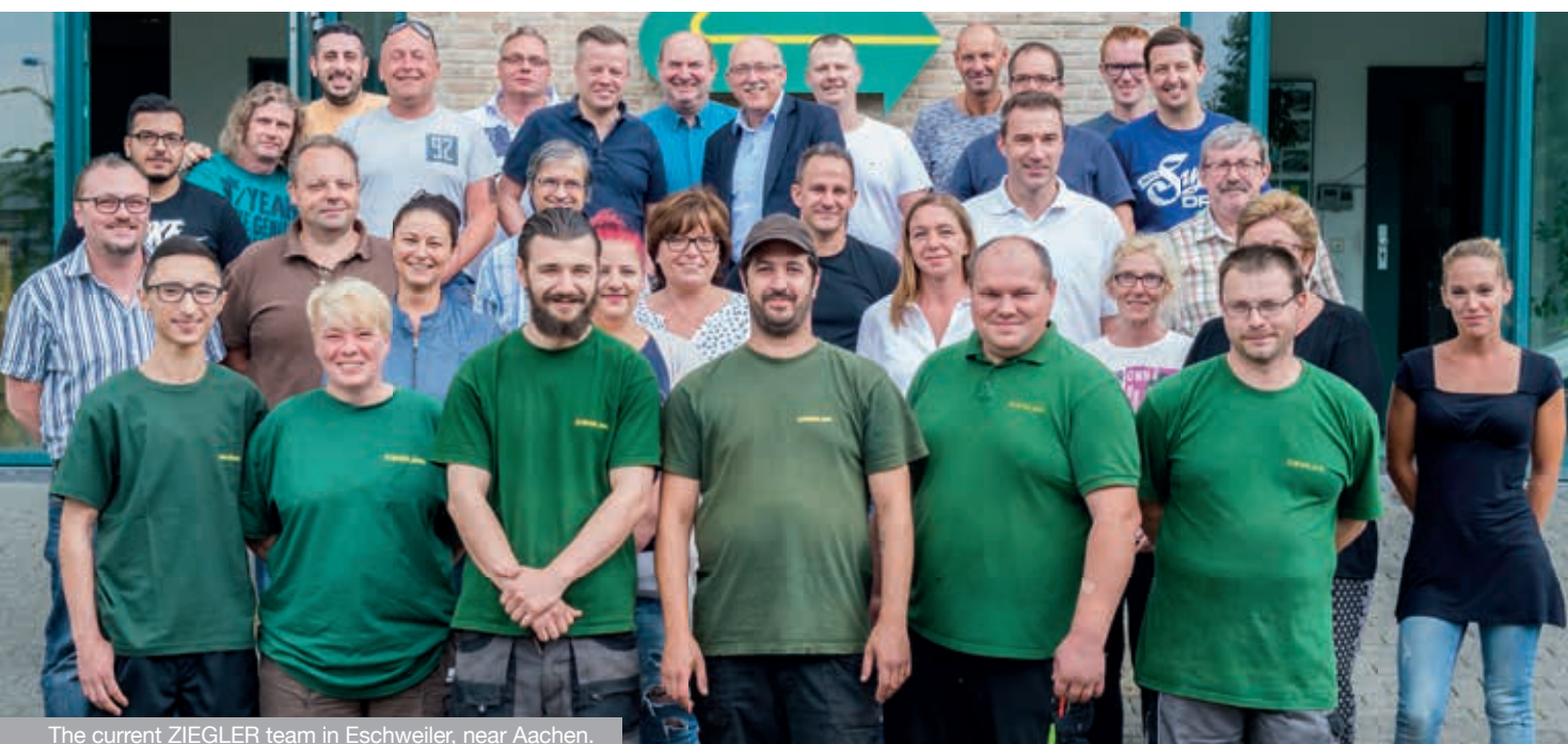
The current ZIEGLER team in Eschweiler, near Aachen.

over amounted to DM 53,895, in 1968 it had more than doubled to DM 137,500, in 1970 it was