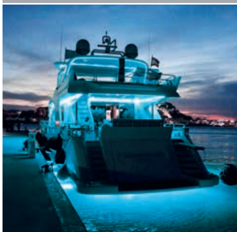
Attractive, durable and saves energy: LED lighting on a yacht.