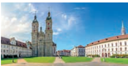
ZIEGLER in St. Gallen Page 16