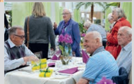
People are looking forward to the next retirees' excursion.