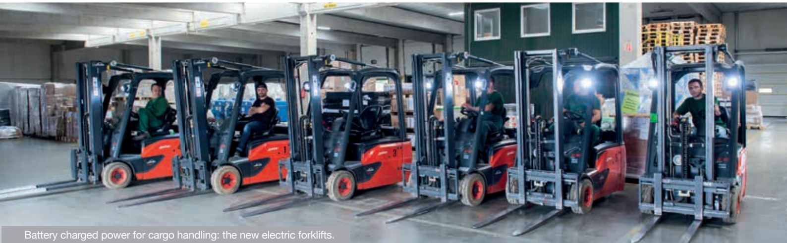
Battery charged power for cargo handling: the new electric forklifts.

Since April, the latest generation of electric forklift trucks have given ZIEGLER in Eschweiler an efficient and even more environmentally friendly cargo handling system. When the electric forklifts drive around the handling area and the logistics centre, they do so with an ingenious wheel steering system that places no stress on the flooring even when they turn 360 degrees. Every electric forklift truck recognises "its" driver from an input code. The full on-board electronics system also ensures that it is possible to see weeks later who worked a shift, for how long and at what average speed. "The new forklifts are the ultimate in terms of safety, quality and accident prevention," Guido Muth happily relates. The ZIEGLER warehouse logistics manager particularly emphasises the use of lithium-ion batteries. "They are soon fully charged and can be recharged at any time without any effect on