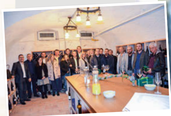
Working together, celebrating together: long-serving employees at ZIEGLER Switzerland.