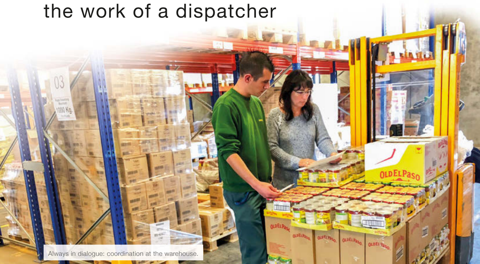
Always in dialogue: coordination at the warehouse.