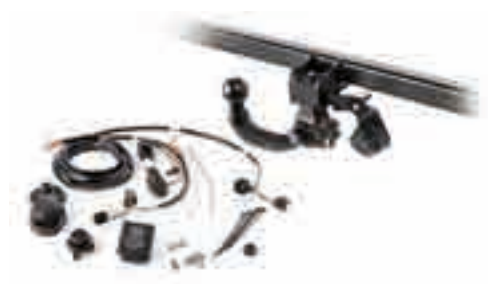
Trailer couplings and wiring harness kits of MVG in Eschweiler. Company building of MVG in Eschweiler.