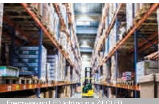
Energy-saving LED lighting in a ZIEGLEF