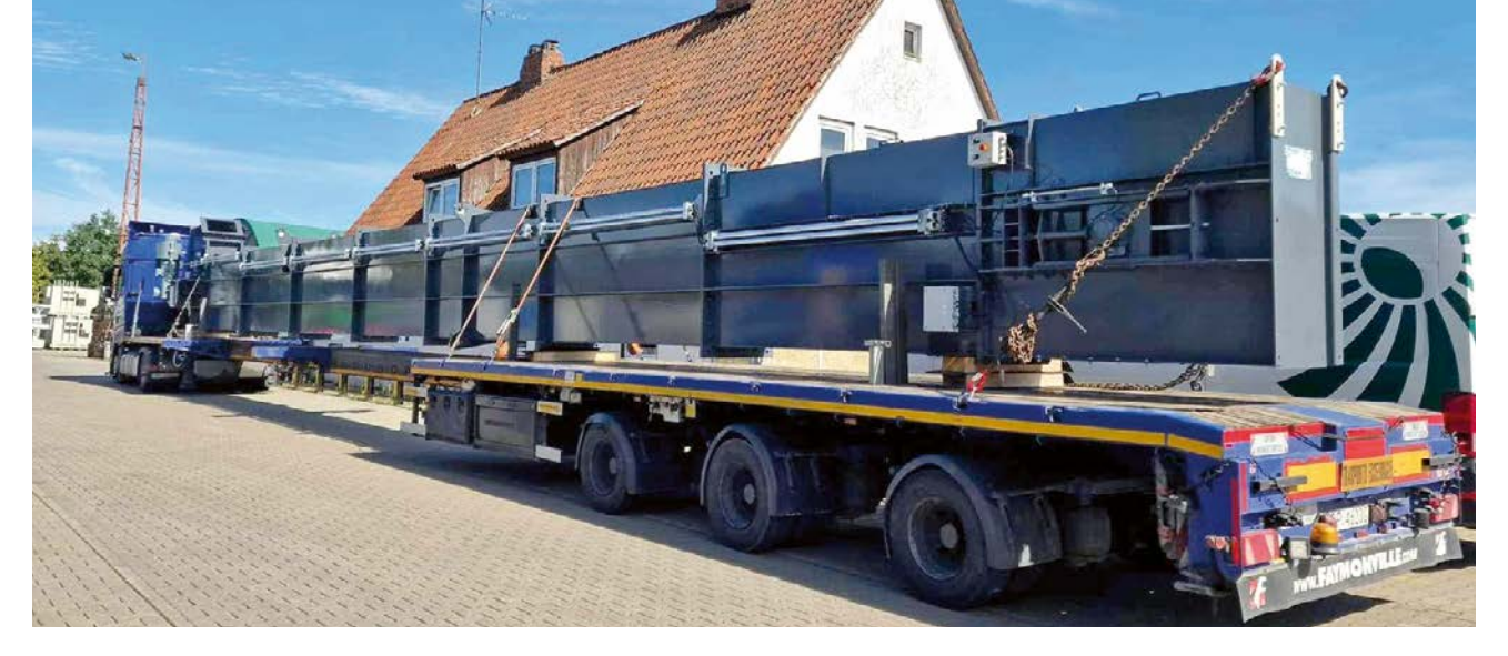
A sifting machine 8.70 x 3.70 x 3.90 metres, 23 tonnes