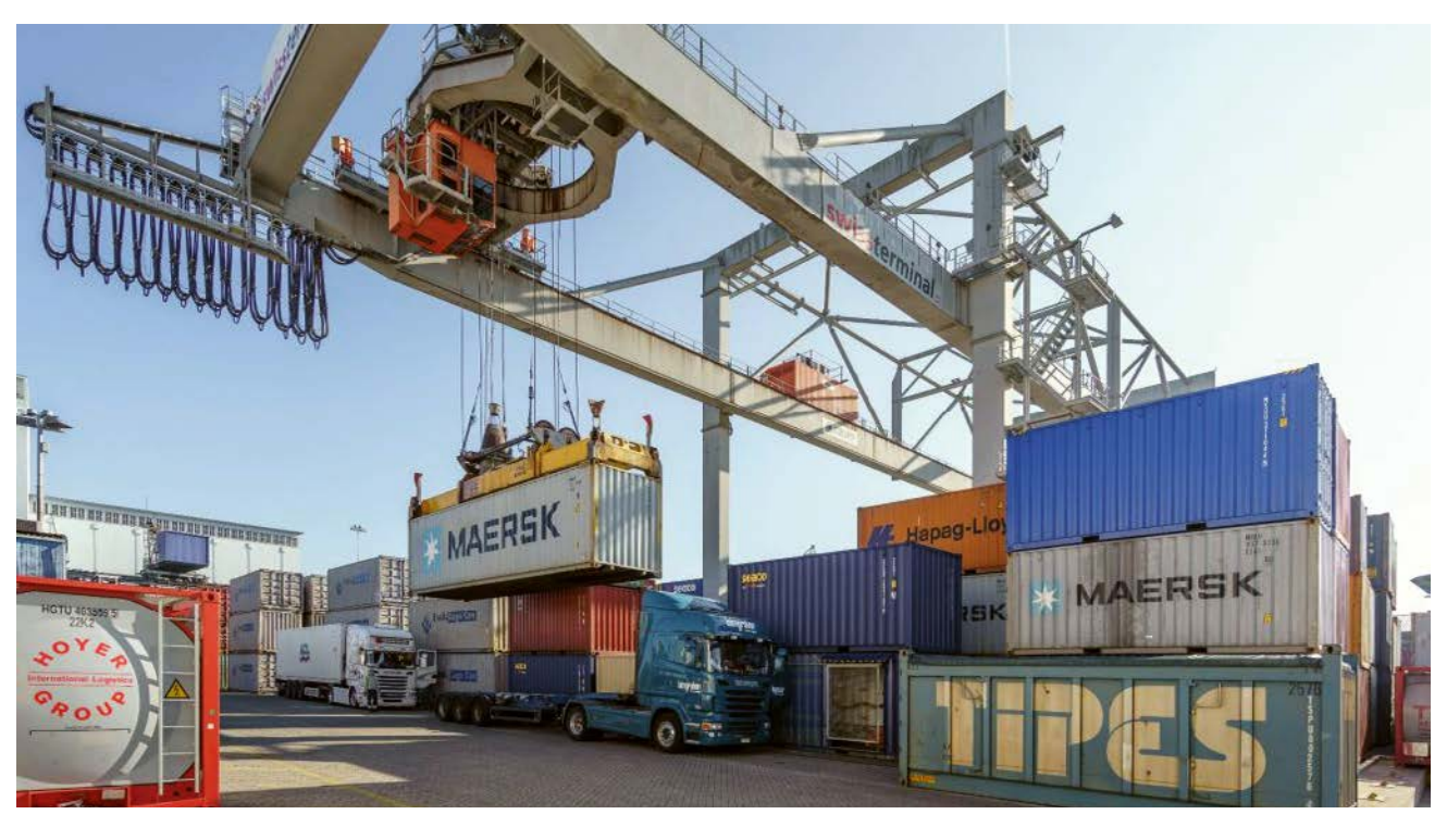
Multimodal container handling at Kleinhüningen in the Port of Basel.

This means in detail: Sea freight including Rhine shipping via Basel, air freight via Dietikon/Zurich, rail and truck. "In this way, we ensure that our export and import shippers receive the best possible service at the best price-performance ratio," reports Emre Karadeniz.