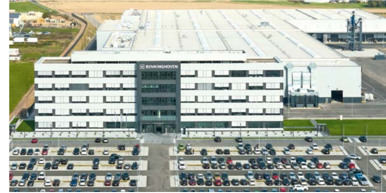
Benninghoven in Wittlich.