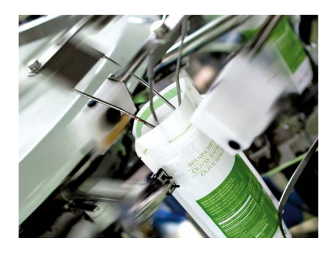
Gentle filling in bags.

Ziegler ensures that the olives arrive quickly, directly and punctually from their country of origin to us in Steinhausen. What do you particularly appreciate about working with Ziegler? Their expertise, flexibility and reliability of transport! With their expansive network, they can fulfil all our requests quickly and efficiently (sea freight, general cargo consignments, full loads or special consignments), and with their internal customs departments, they are also on hand to help us with customs problems