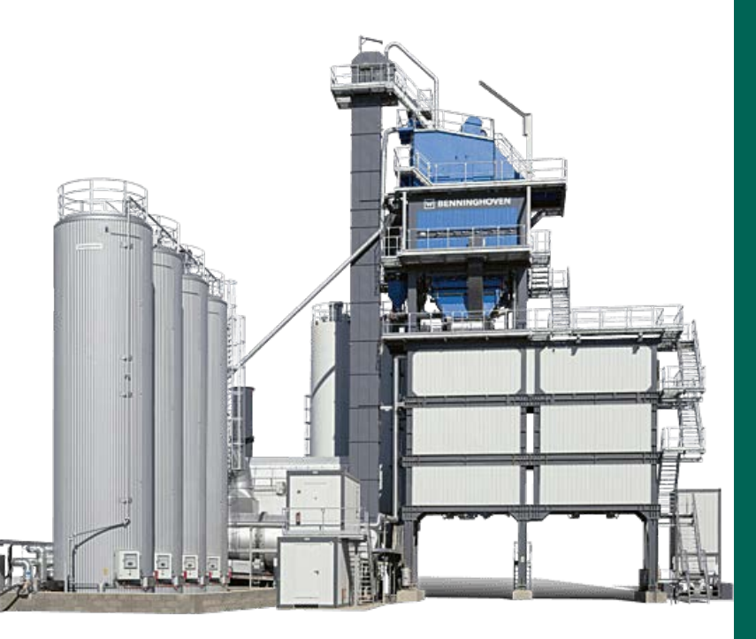
The TBA 3000 asphalt mixing plant.

The right system solution for the respective market requirements: Be it transportable or stationary, in capacities from 100 - 400 \, t/h – one thing is always the same: Benninghoven offers the most cutting-edge solutions for producing asphalt economically, flexibly and in an environmentally friendly way.