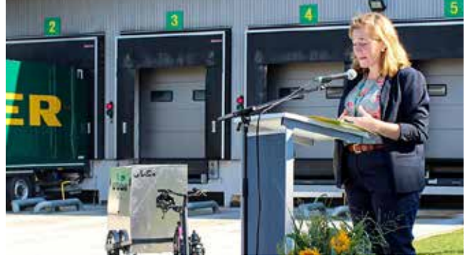
Supports environmentally friendly logistics: Elke Van den Brandt, Minister of the Brussels-Capital Region Government.