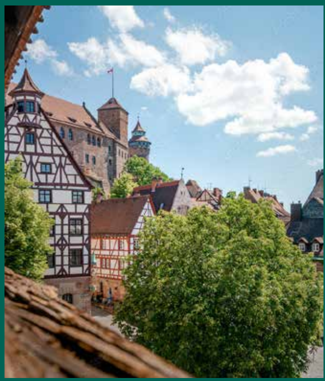
View of the Imperial Castle.

E-mail: ziegler_nuernberg@zieglergroup.com