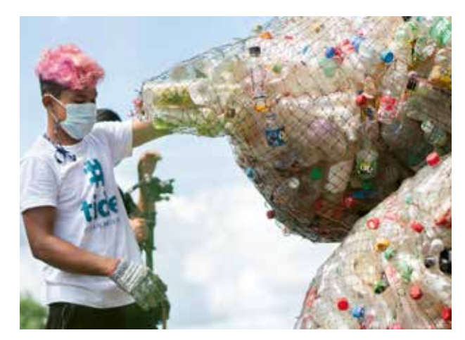
Working in the Andaman Sea, Thailand

#tide organises beach clean-ups, pays fair wages and upholds high ethical standards. A large part of #tide's revenue benefits these coastal regions, where social and environmental impacts are of utmost importance. Therefore #tide is twofold: