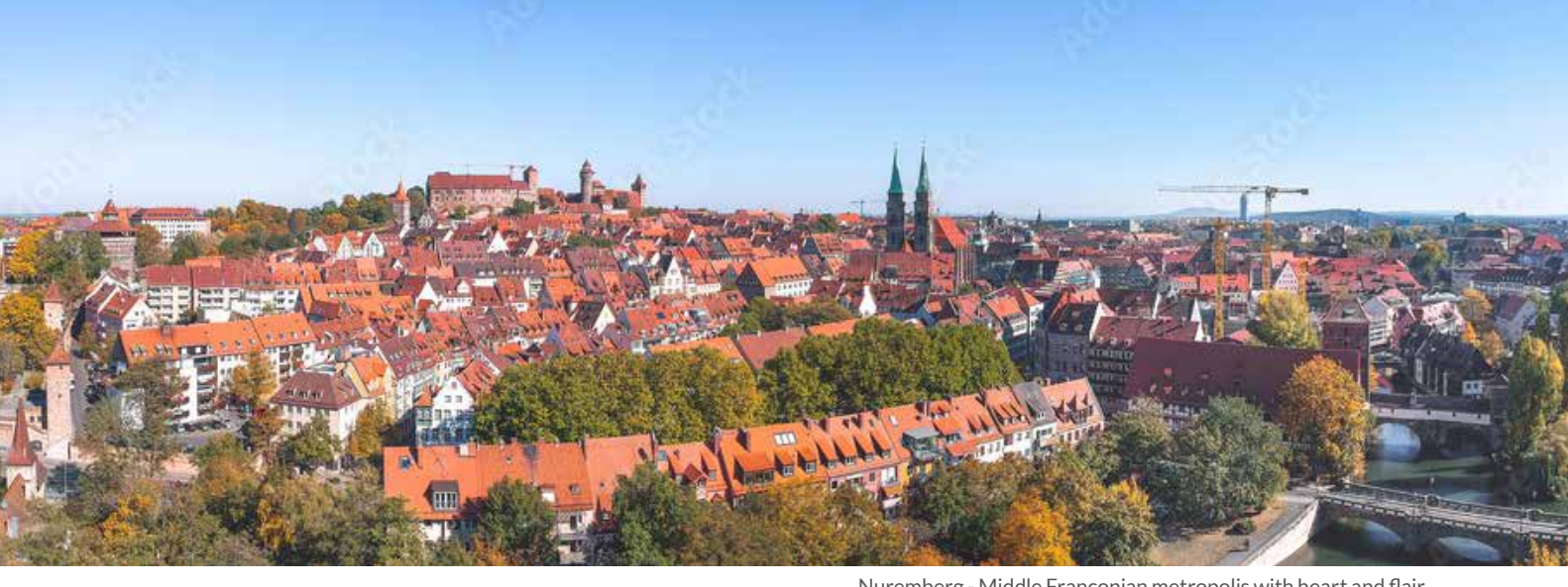
Nuremberg - Middle Franconian metropolis with heart and flair.