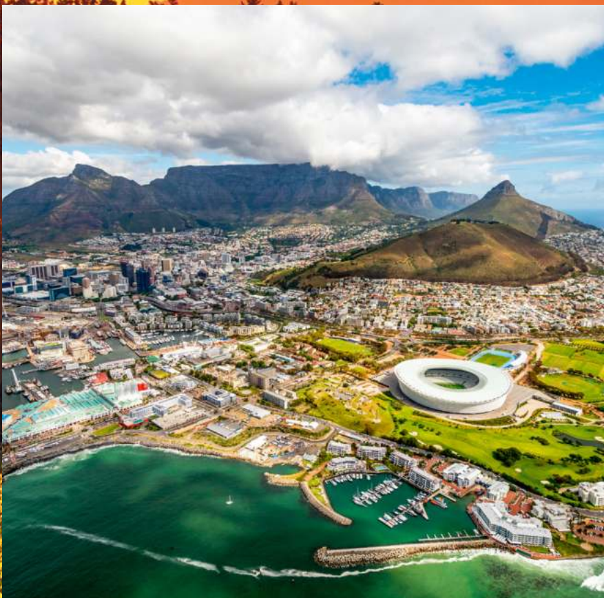
Cape Town, one of the three capitals of South Africa.

ZIEGLER South Africa is a full-service logistics provider specialising in International Air, Ocean and Road Transport. Ziegler South Africa also offers a vast range of additional Supply Chain Services such as Warehousing, Distribution, Aerospace, Trade Finance and Fiscal Representation, to mention only a few. The differentiator: Offices on the borders of main exit points to SADC Countries.