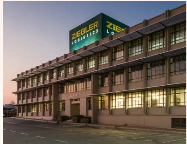
ZIEGLER office in Johannesburg.

The people of ZIEGLER South Africa is what makes the company stand out, the company culture is based