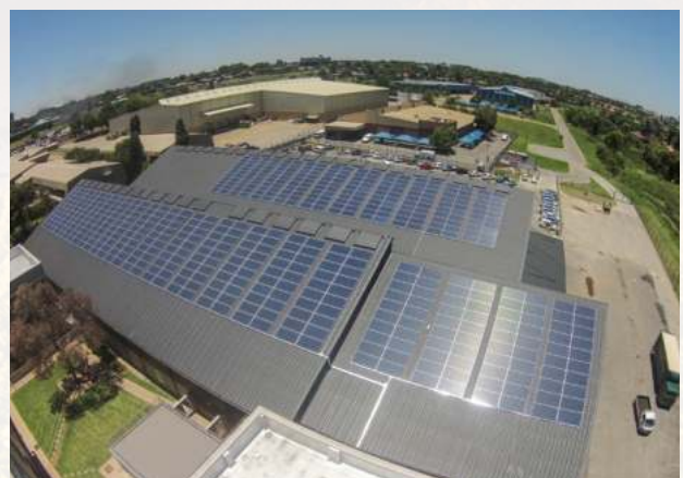
Solar panels on the roof of the warehouse in Johannesburg.

Environmental protection is important and ZIEGLER South Africa takes the concept of being a Green Company to the next level. In 2010 ZIEGLER South Africa provided logistics for the 71 Mega-Watt Solar Park in Kathu and now boast a 178 Kilo-Watt PV Solar System on their own warehouse at their head office in Johannesburg, this Solar System Provides the company with over 70% of their power. Over the last 10 years, ZIEGLER South Africa helped change the face of African Energy through arranging the logistics of over a 1 000 Mega-Watts of PV Panels.