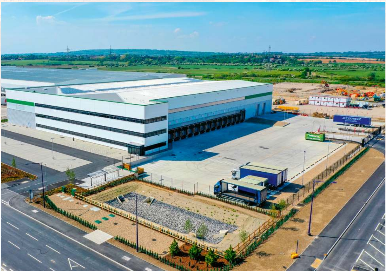
The new ZIEGLER headquarters in the United Kingdom.